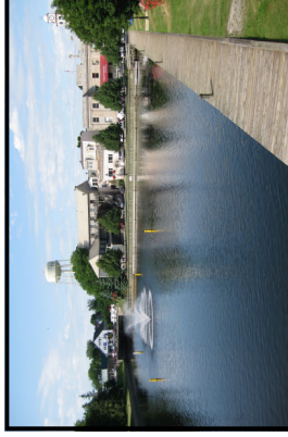
The Tay Basin, in the heart of Perth, featuring the International Friendship Fountains.