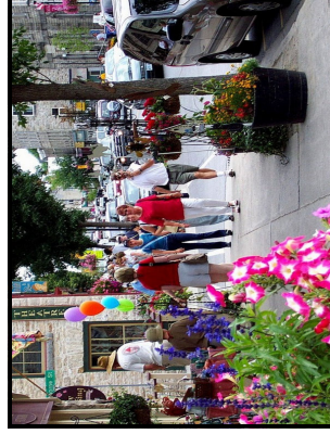
Downtown Perth: Our Scottish heritage shows through in the architecture! Streetscapes feature lush floral units, many fine restaurants, pubs and cafes, as well as unique shops for all tastes. Festivals and events keep tourists coming back again and again!