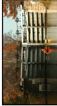
The Rideau Canal and its 47 Lock Stations were inscribed as a World Heritage Site by UNESCO in June 2007 and described as "...a masterpiece of human creative genius." The Lock Stations are a great experience for all ages.

Parks Canada maintains a draught of 5' in the Tay Canal, right up to the Tay Basin. The Canal is narrow, so it's best to stay in the centre lane to the extent possible.