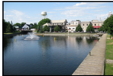
The Tay Basin, in the heart of Perth, featuring the International Friendship Fountains.