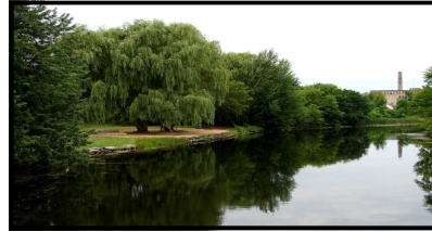
The scenic route: Across Craig St. leaving Last Duel Park, the Tow Path is a 10-minute walk to Downtown Perth.