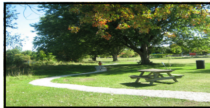
The Ribbon of Life: the strip where water meets land. Plant and animal life here relies on a natural habitat to survive and flourish. The Ribbon of Life provides food, breeding grounds and shelter for various wildlife. It helps to prevent shoreline erosion and filter out pollutants.

Visitors are welcome to use the picnic area, just a stone's throw from the docks. The Wendy Laut Ribbon of Life is a new walking trail that follows the Tay River a short distance to the Campgrounds.