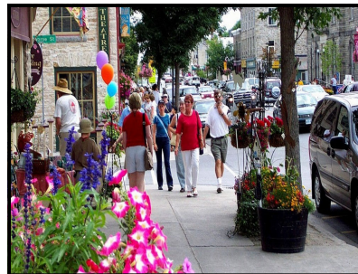
Downtown Perth: Our Scottish heritage shows through in the architecture! Streetscapes feature lush floral units, many fine restaurants, pubs and cafes, as well as unique shops for all tastes. Festivals and events keep tourists coming back again and again!